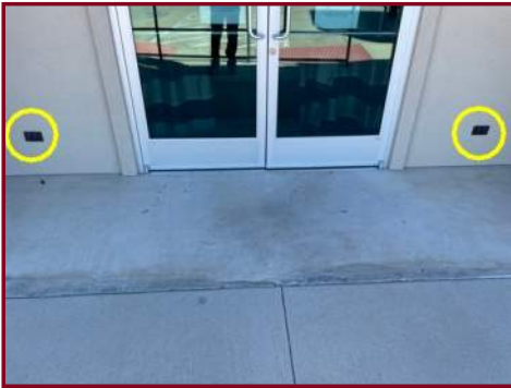
NO GFCI ON EXTERIOR RECEPTACLES