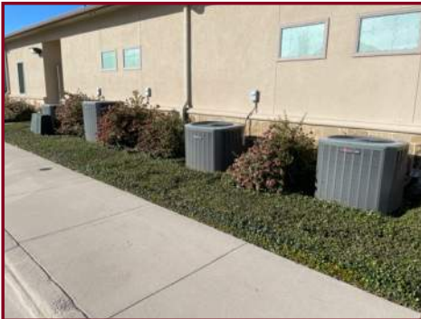
COOLING SYSTEM UNITS

condensing coils causing the system to become inefficient. Foliage should be trimmed away from condensing units at all times.