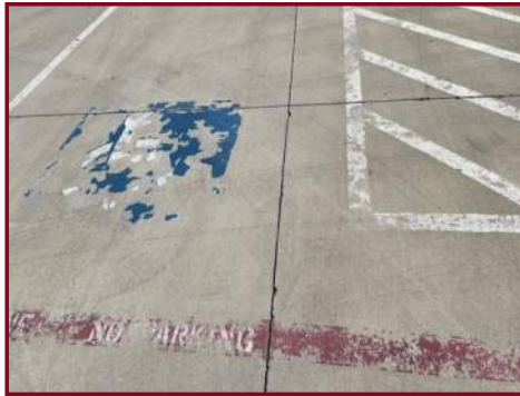
FADED PARKING STRIPING