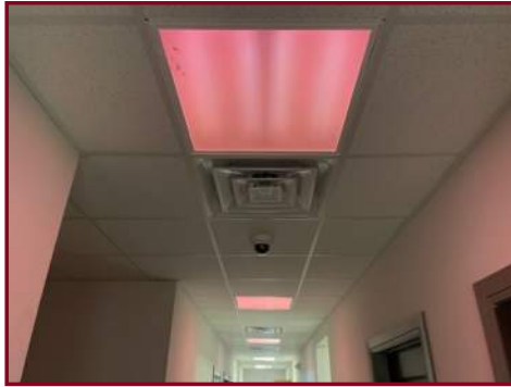
INOPERABLE LIGHT FIXTURES IN REAR HALLWAY