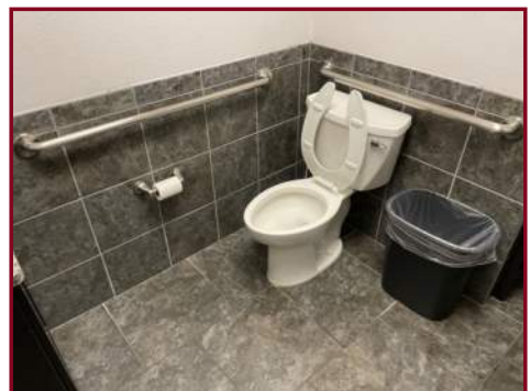
MEN'S PUBLIC RESTROOM TOILET