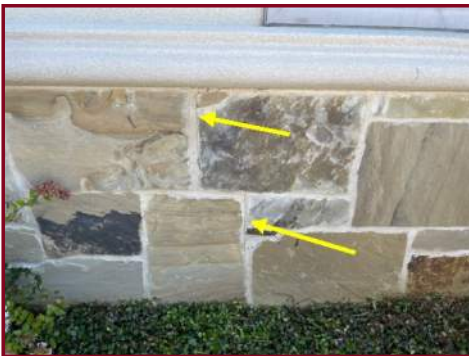
THERMAL EXPANSION CRACK IN STONE VENEER AT SOUTHWEST CORNER