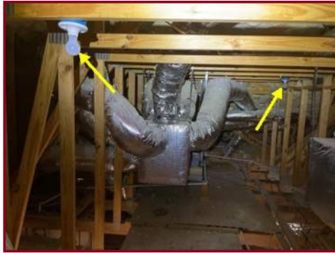
INOPERABLE LIGHT FIXTURES IN ATTIC