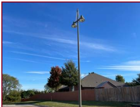
POLE MOUNTED FIXTURES