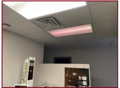
INOPERABLE LIGHT FIXTURE IN FITTING ROOM