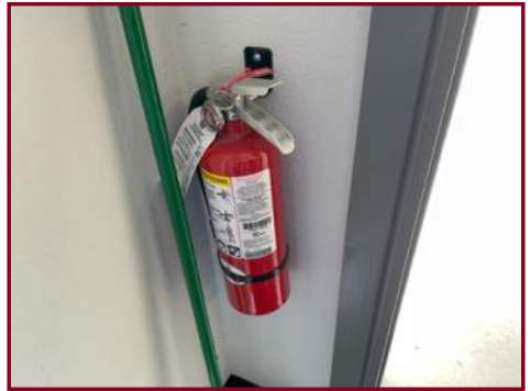
TYPICAL FIRE EXTINGUISHER