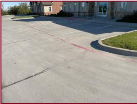
STRIPING IS FADING