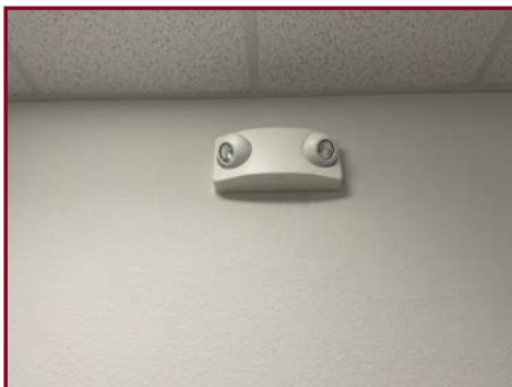
TYPICAL EMERGENCY LIGHTING