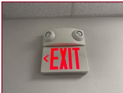
TYPICAL EXIT SIGN WITH EMERGENCY LIGHTING