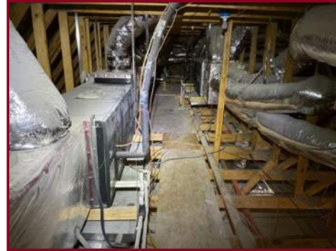
DECKED PASSAGE IN ATTIC