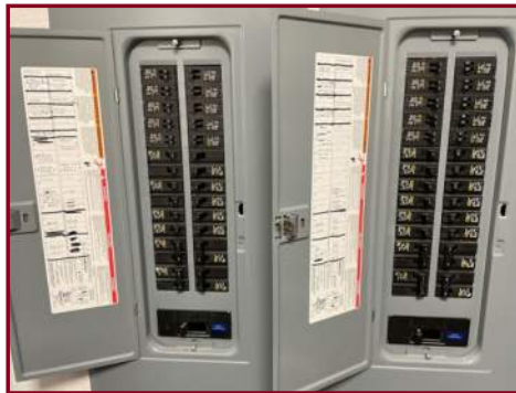
BREAKER PANELS ARE LABELED