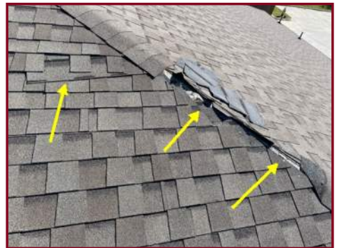
SHINGLE PULLING LOOSE AND DAMAGED RIDGE CAP ON SOUTHWEST CORNER HIP