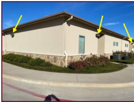
SOUTH & EAST WALL MOUNTED FIXTURES