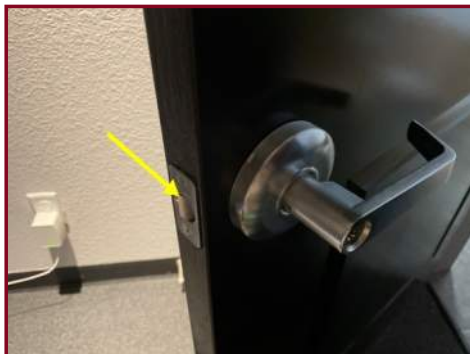
PLUNGER STUCK ON DOOR TO COMPUTER ROOM