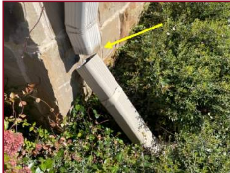
GUTTER DOWNSPOUT SEPARATED AT SOUTHWEST CORNER