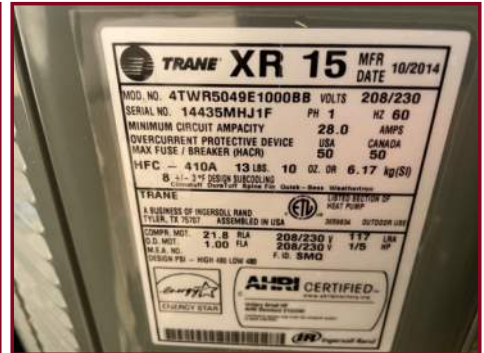
UNIT #2 NOMENCLATURE PLATE