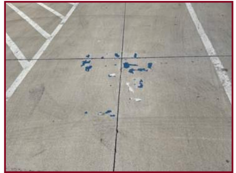
FADED HANDICAP SIGN