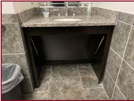
MEN'S PUBLIC RESTROOM LAVATORY