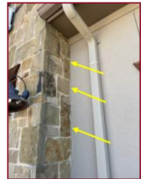
JOINT NEEDS SEALING BETWEEN STONE VENEER AND STUCCO