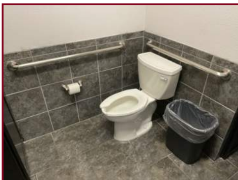
WOMEN'S PUBLIC RESTROOM TOILET

No observed or reported deficiencies were noted.