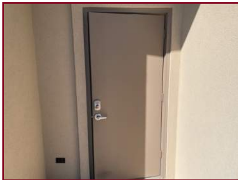
NORTH REAR EXIT DOOR