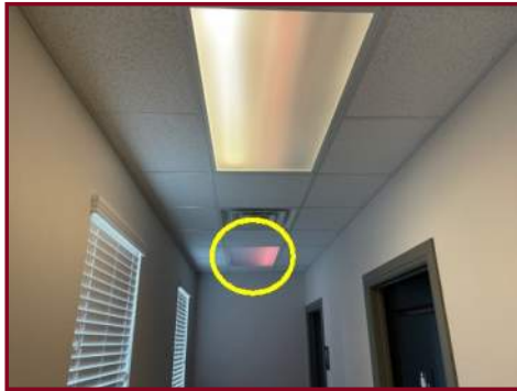
INOPERABLE LIGHT FIXTURE IN PUBLIC RESTROOM HALLWAY