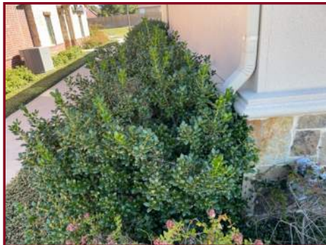
HEAVY FOLIAGE ON NORTH SIDE