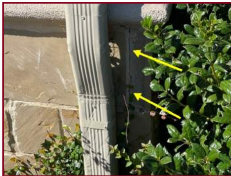
THERMAL EXPANSION CRACK IN STONE VENEER AT NORTHEAST CORNER