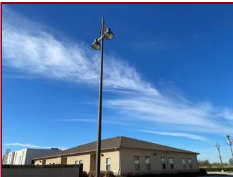
POLE MOUNTED FIXTURES