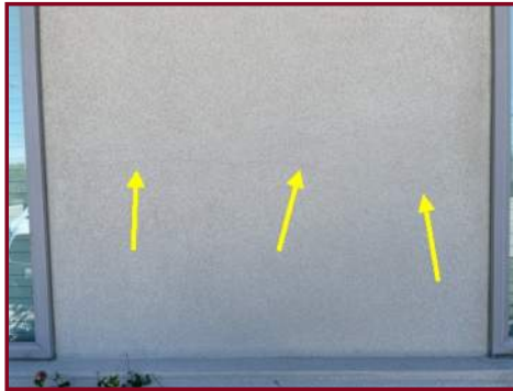
SMALL CRACKS IN STUCCO