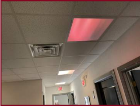
INOPERABLE LIGHT FIXTURE IN SOUTH HALLWAY