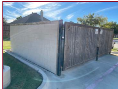
WASTE STORAGE AREA