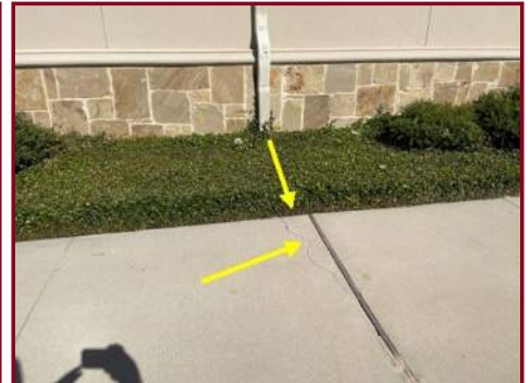
DOWNSPOUTS SHOULD BE EXTENDED TO SIDEWALK