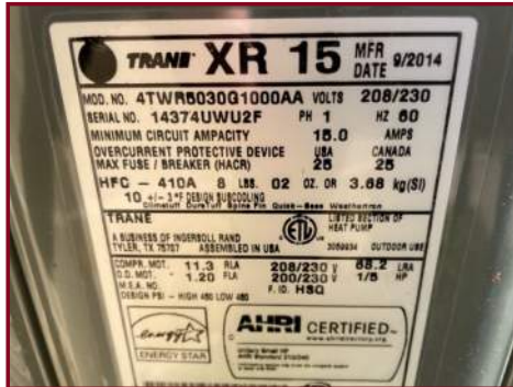
UNIT #1 NOMENCLATURE PLATE