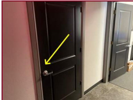
EAST STORAGE CLOSET DOOR IN REAR HALLWAY NOT LATCHING PROPERLY