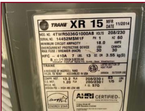
UNIT #3 NOMENCLATURE PLATE