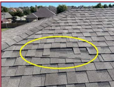
SHINGLE TAB SLIDING OUT OF PLACE