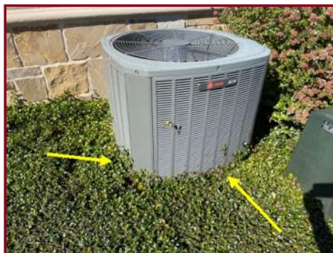
HEAVY FOLIAGE AROUND COOLING UNITS