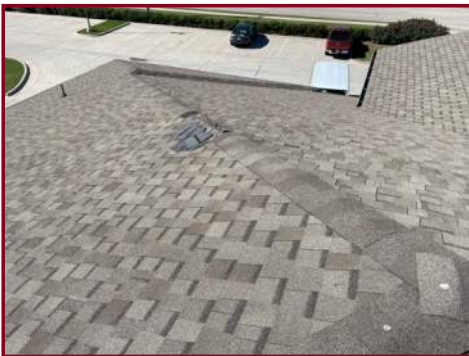
DAMAGED RIDGE CAP ON SOUTHWEST CORNER HIP

Damaged shingles were observed on the East Side of the roof structure.