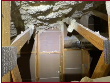
DRAFT STOP WALL IN ATTIC