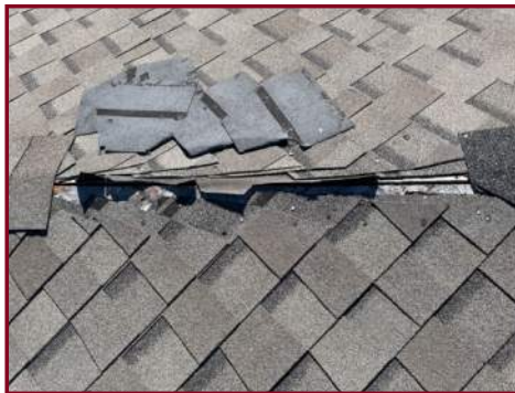
DAMAGED RIDGE CAP ON SOUTHWEST CORNER HIP