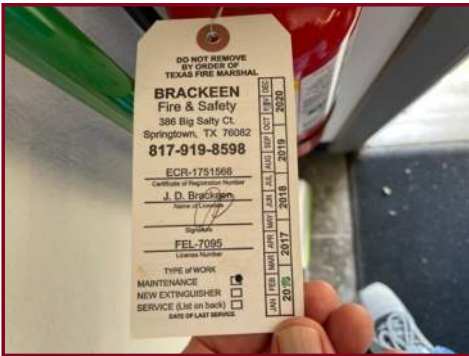
FIRE EXTINGUISHER INSPECTION TAG