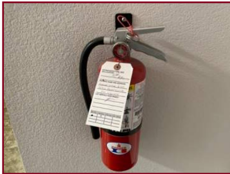
TYPICAL FIRE EXTINGUISHER