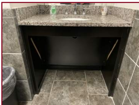
WOMEN'S PUBLIC RESTROOM LAVATORY