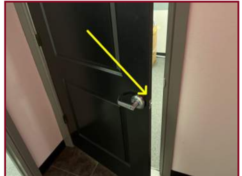
DOOR NOT LATCHING TO ELECTRICAL ROOM