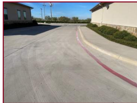
PAVING & CURBING