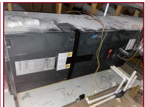
HEATING UNIT #4