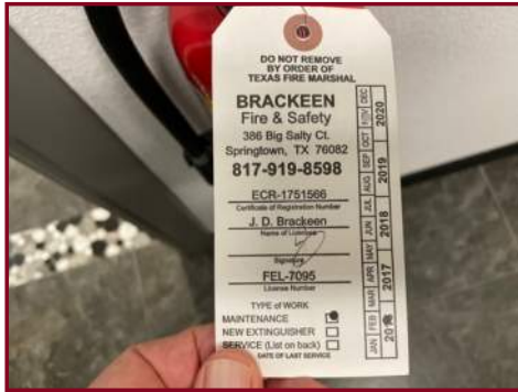
FIRE EXTINGUISHER INSPECTION TAG