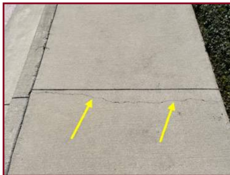
CRACK IN SIDEWALK ON EAST SIDE