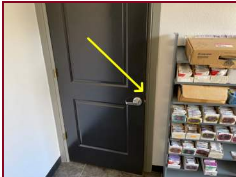
DOOR NOT LATCHING TO REAR HALLWAY

The false front covering the plumbing pipes was observed to be missing to the lavatory in the rear employees restroom.