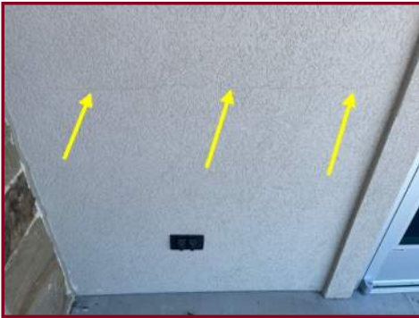
SMALL CRACK IN STUCCO

missing. Condition should be further evaluated and corrected as necessary.