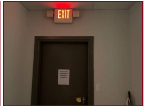
TYPICAL EXIT SIGN WITH EMERGENCY LIGHTING