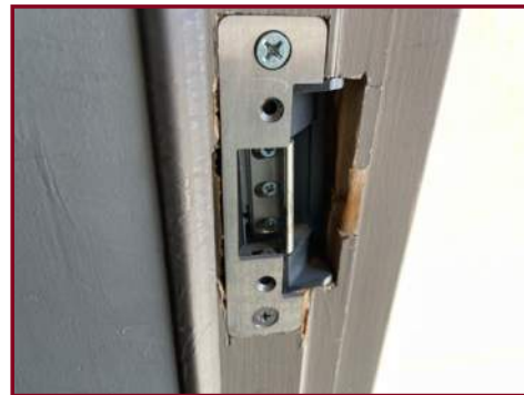
STRIKE PLATE MISSING SCREWS ON SOUTH REAR EXIT DOOR