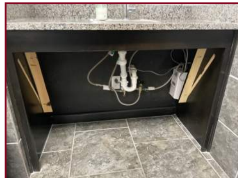
EMPLOYEES RESTROOM LAVATORY CABINET WAS MISSING THE COVER