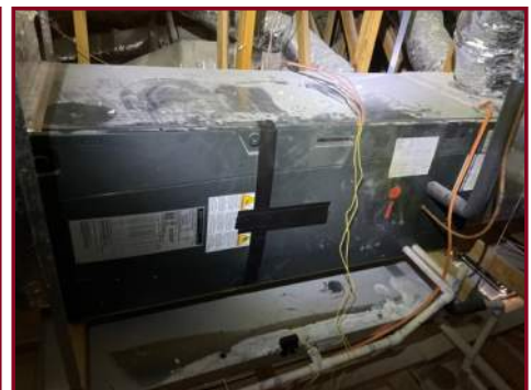
HEATING UNIT #1