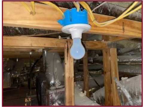
INOPERABLE LIGHTS IN ATTIC