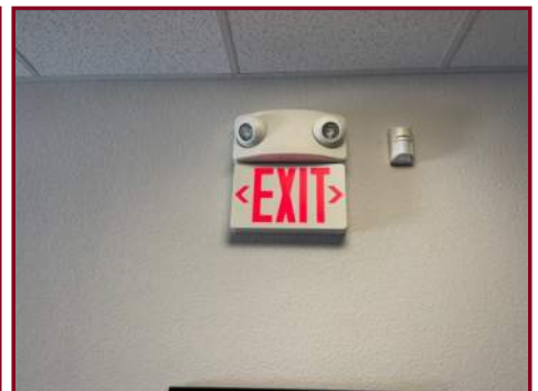
TYPICAL EXIT SIGN AND EMERGENCY LIGHTING