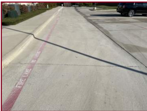
PAVING & CURBING

No observed or reported deficiencies were noted.