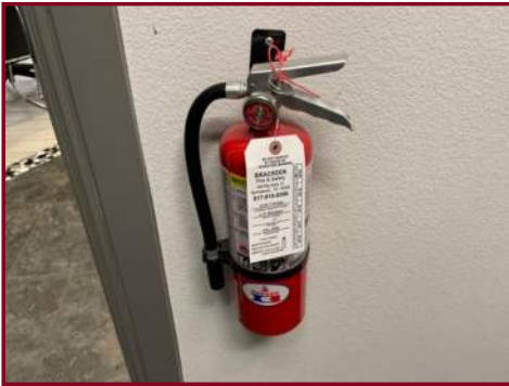
TYPICAL FIRE EXTINGUISHER