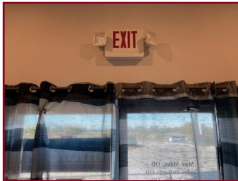
TYPICAL EXIT SIGN WITH EMERGENCY LIGHTING