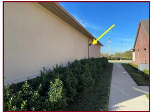
NORTH WALL MOUNTED FIXTURES