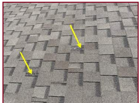
DAMAGED SHINGLE TABS ON EAST SIDE OF ROOF