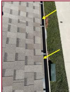
GRANULES IN GUTTER

The downspouts around the subject building handle a large volume of water when raining. Large areas of erosion creating depressions were observed in various locations around the building. These areas are allowing water to pond or stand next to the foundation. Water should not be allowed to stand near a foundation for more than 24 hours. Extensions should be added to the downspouts allowing water to drain away from the foundation.