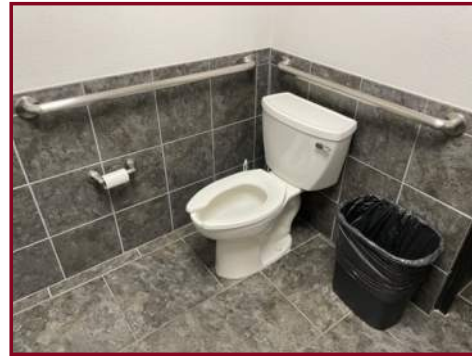
EMPLOYEES RESTROOM TOILET