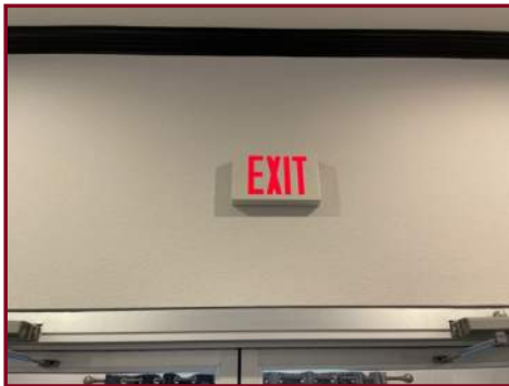
TYPICAL EXIT SIGN

No observed or reported deficiencies were noted.