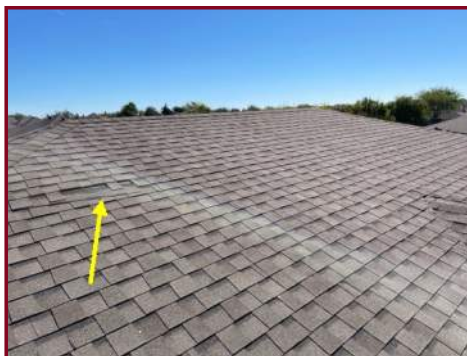
SHINGLE TAB SLIDING OUT OF PLACE