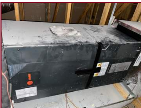
HEATING UNIT #2