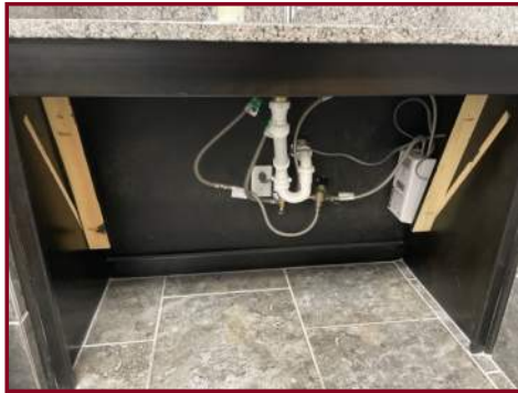
EMPLOYEES RESTROOM WATER HEATER ASSEMBLY