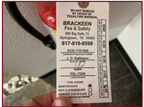
FIRE EXTINGUISHER INSPECTION TAG