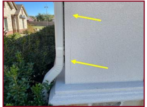
CRACK IN STUCCO AT NORTHWEST CORNER