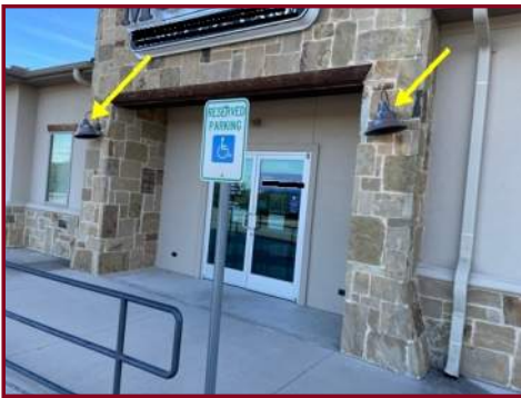
WEST SITE LIGHTING