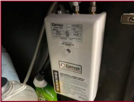
TYPICAL UNDERCOUNTER WATER HEATER