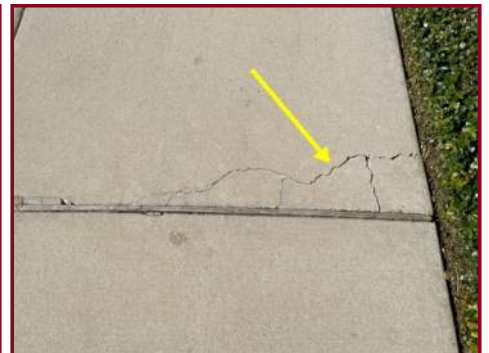
CRACKED/DAMAGED SIDEWALK ON SOUTH SIDE