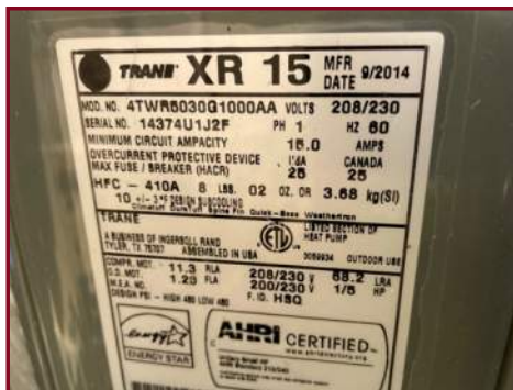
UNIT #4 NOMENCLATURE PLATE