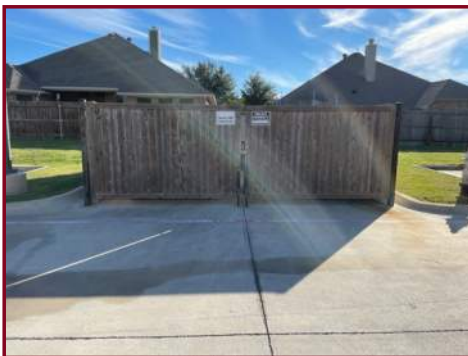
WASTE STORAGE AREA

No observed or reported deficiencies were noted.