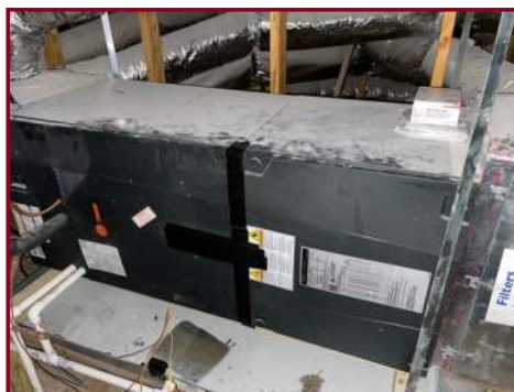
HEATING UNIT #3